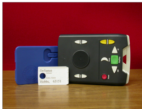
Standard Player, Cartridge, and Mailing Case